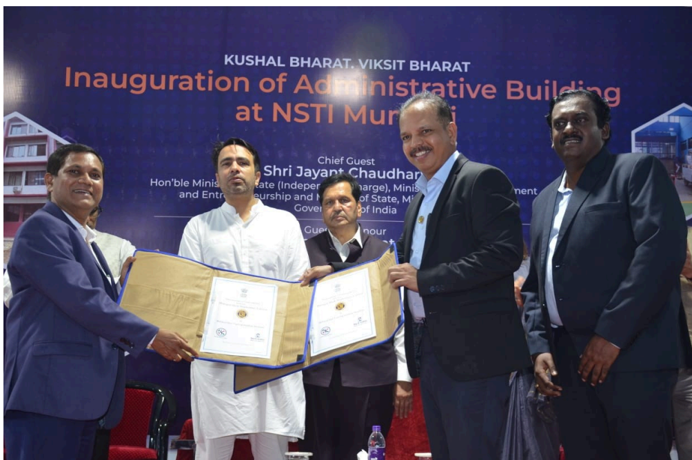
The Minister of State for Skill Development also inaugurated the Renovated Workshop Sections namely Motor Mechanic Vehicle Section and Welder Section along with other dignitaries.