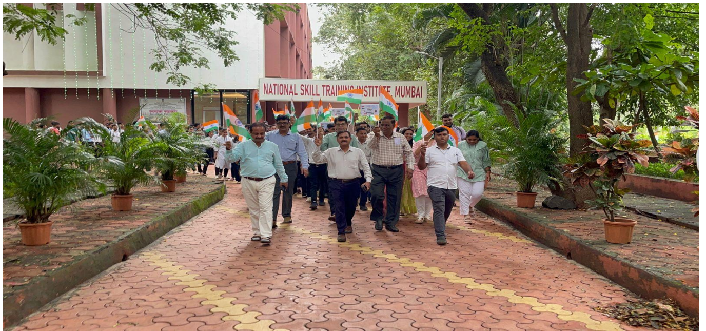
Har Ghar Tiranga rally conducted at RDSDE MAHARASHTRA & NSTI MUMBAI